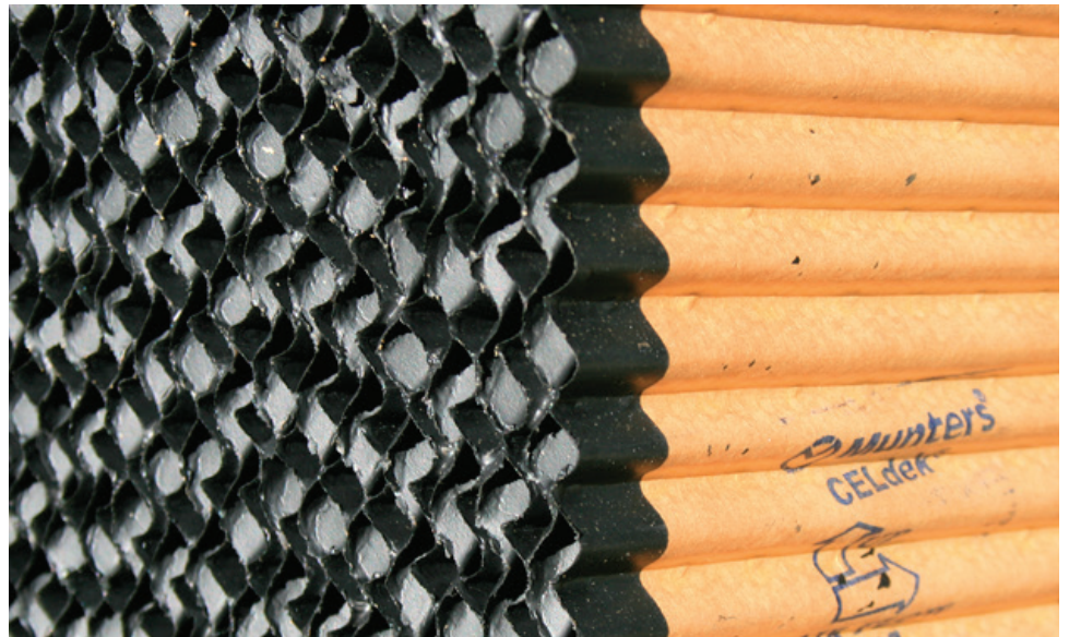
Munters MI-T-edg protects the CELdek pads from damaging effects of severe weather and UV light.

Munters MI-T-edg is nonporous and quick drying. It prevents algae and minerals from anchoring themselves into the substrate of the pad, so they slough off when dried. MI-T-edg also protects CELdek pads from the damaging effects of severe weather and long term exposure to UV light.